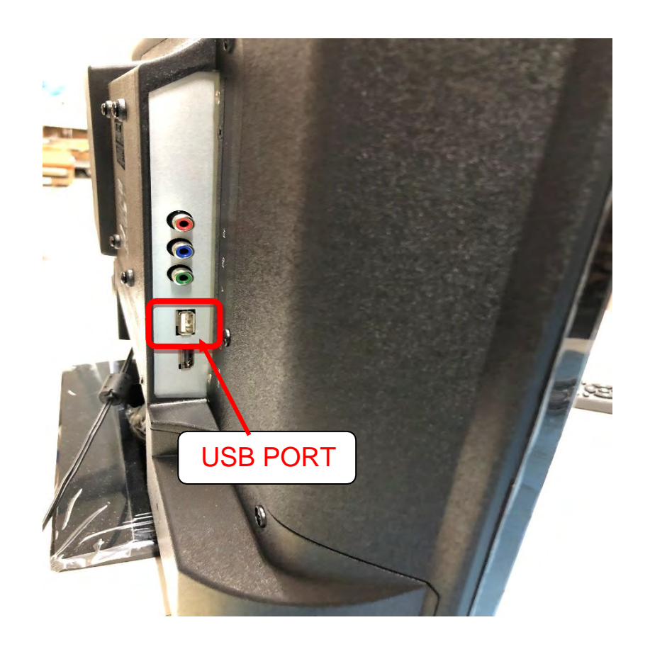
Page 1 of 3