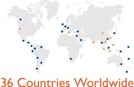
• sales / marketing • production